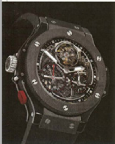
The Bigger Bang Drive is a revolutionary, upside-down watch that is exclusive to the Hublot boutique in Paris.